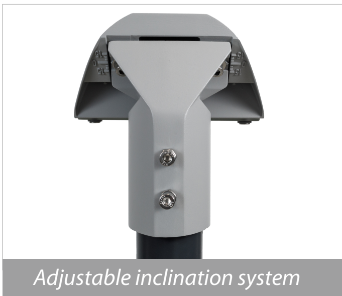
Adjustable inclination system

Armature is equipped with Service Tag: 1 copy inside the luminaire. Use copy 2 and 3 inside the pole lid and luminaire register.