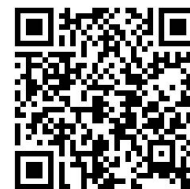
Service tag with QR code

Refer to Service Tag for future Service.